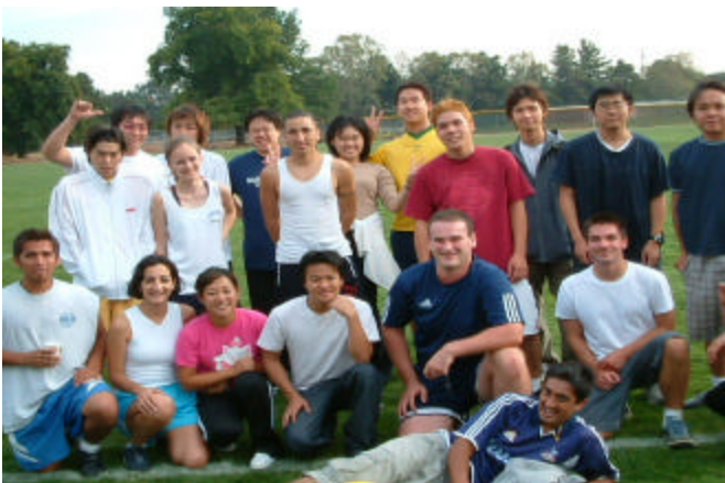
Members of the ISC club and IEC after a game of soccer