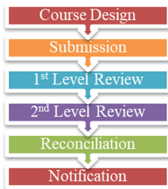
Figure 1: Annual Review Process

CCCs submit new or revised course outlines to the CSU and UC system offices electronically via ASSIST Intersegmental faculty and staff then evaluate the outlines for consistency with the respective policy documents. CCCs are responsible for submitting accurate and current course outlines. If a course has changed substantially since its last review, a CCC should select “Substantial Change” during the course submission process. (For a description of what counts as a “substantial” change, see Submission, below.)